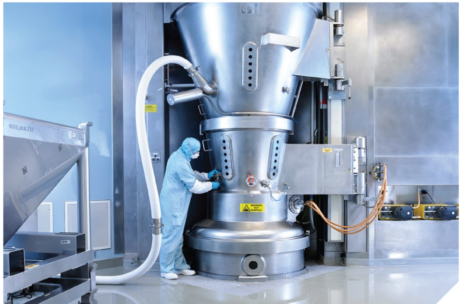
Glatt GPCG 300 at the Alkermes Athlone, Ireland Site

Alkermes Contract Pharma Services, a division of Alkermes Pharma Ireland Ltd, has significant experience in bead-coating processes to provide you with expert solutions to fulfill your specific manufacturing needs. With more than 40 years of experience manufacturing for global markets at our dedicated site in Ireland, our key focus is to make quality medicines on-time, every-time for our partners.